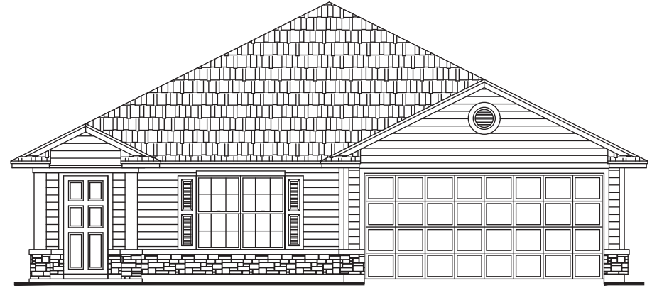
ELEVATION D-2 SHOWN W/ OPT STONE