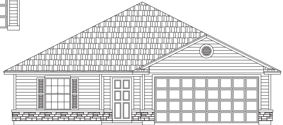
ELEVATION D-2 SHOWN WITH OPTIONAL STONE

FLOOR PLAN AND RENDERING ARE FOR CONCEPTUAL PURPOSES ONLY. DIMENSIONS AND OTHER INFORMATION ARE APPROXIMATE AND SUBJECT TO CHANGE. 04/19.